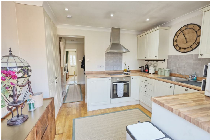
KITCHEN 10'7" x 9'0" (3.23 x 2.74)