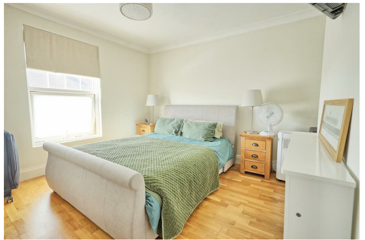
BEDROOM ONE 12'1" x 10'9" (3.7 x 3.28)